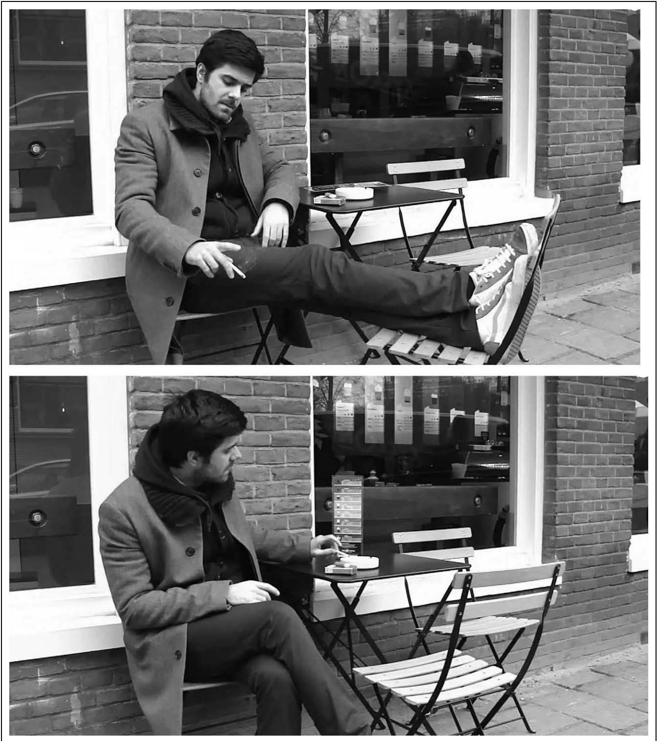
Figure 1. Screenshots from the norm-violation (top) and control condition (bottom) video clips (study 3)

“Bring me a vegetarian sandwich and a sweet coffee” (“May I have a vegetarian sandwich and a sweet coffee, please?”). The waiter says, “Right away,” and he does not reply (replies: “Thank you”). He puts out his cigarette on the pavement (in the ashtray).